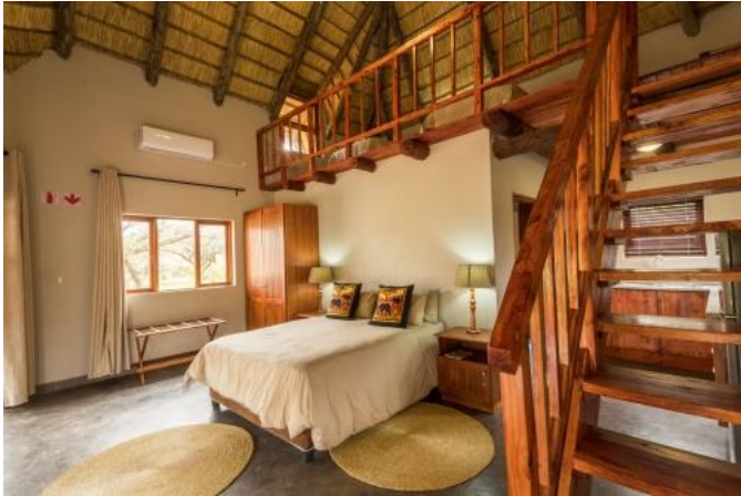
Inside one of the chalets at Tinsale