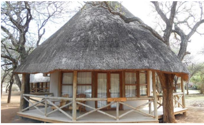
Chalet at Tinsale