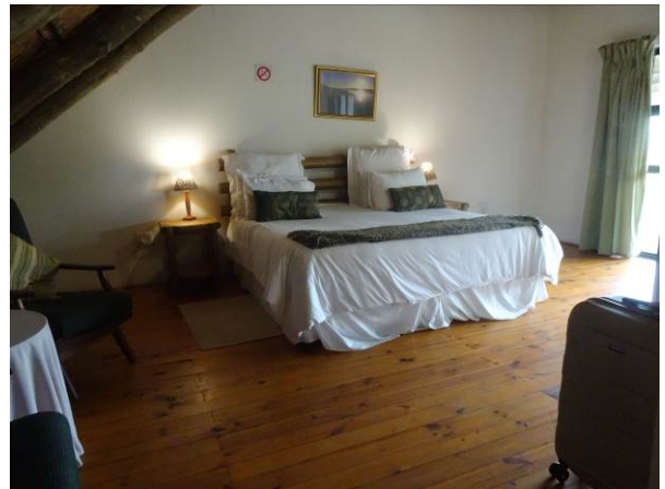
The Kob Inn

Mazeppa Bay is characterized by its own Island. Depending on the tide, this is sometimes only accessible by a quaint suspension bridge, which joins the Island to the main beach. The hotel boasts a tennis court, full size snooker table, beach volley ball, table tennis, a trampoline for the children, DSTV in the communal TV lounge, and two bars in which to enjoy sundowners after a long day on the beach and rocks. The rooms range in size from standard rooms to suites and all have an en suite bathroom.