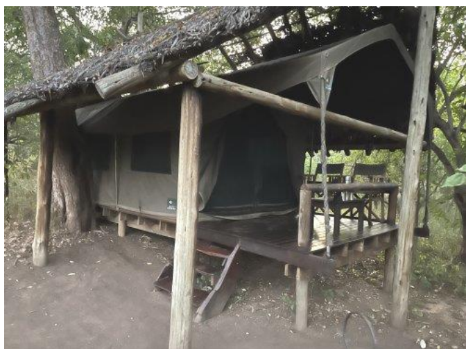
Tent at Two Mashatus Camp

The camp is not enclosed and so you might encounter game in and around camp.