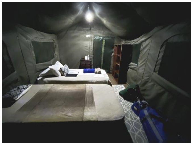
Interior of twin tent at Two Mashatus Camp

Overnight Two Mashatus Camp. Two Mashatus is a semi-permanent tented camp. There are five comfortable and roomy tents, each on its own raised teak platform, with en-suite bathroom.