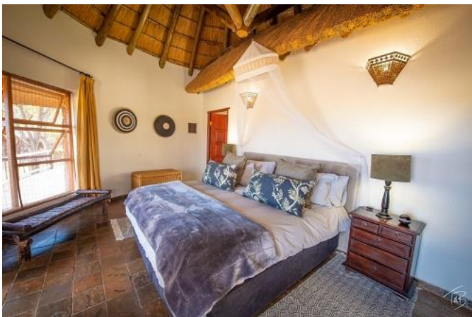
One of the bedrooms at Savannah Lodge

The lodge has its own plunge pool, with wonderful views of the plains beyond. Take a dip and then recline in one of the sun-loungers – a perfect way to relax after a day in the saddle.