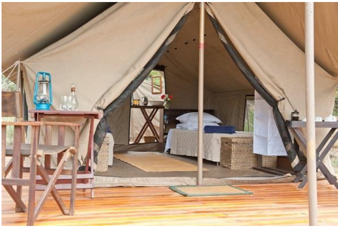
Twin tent at Camp Davidson