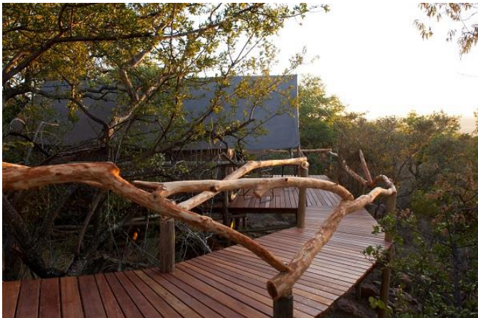
View from the raised walkway at Camp Davidson

Overnight Camp Davidson. Camp Davidson is a permanent tented camp with its own plunge pool. It is set on a rocky outcrop a few kilometres north of the main Horizon Lodge. Each tent has its own shower and toilet.