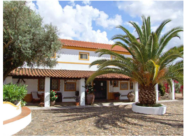
Monte dos Aroeirais

A single supplement is payable to guarantee a single room. If you are willing to share, the supplement is payable initially and then refunded if we find you a sharer.