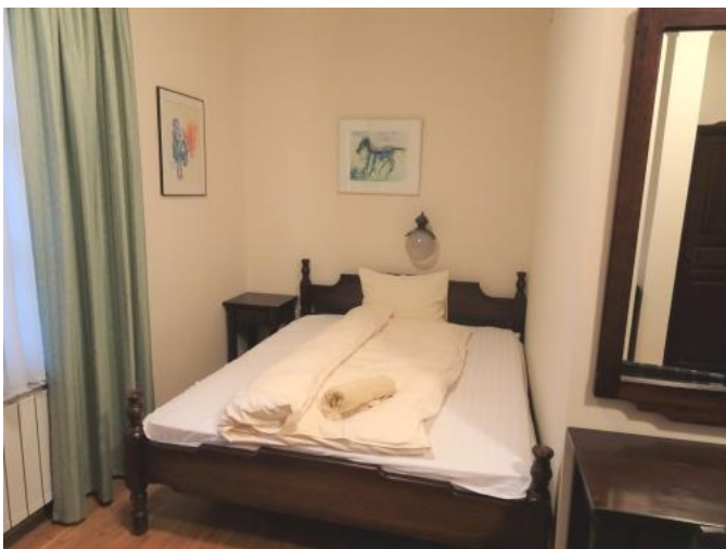
Double room at Hotel Kalin

Hotel Kalin is a cosy mountain hotel with a traditional design.