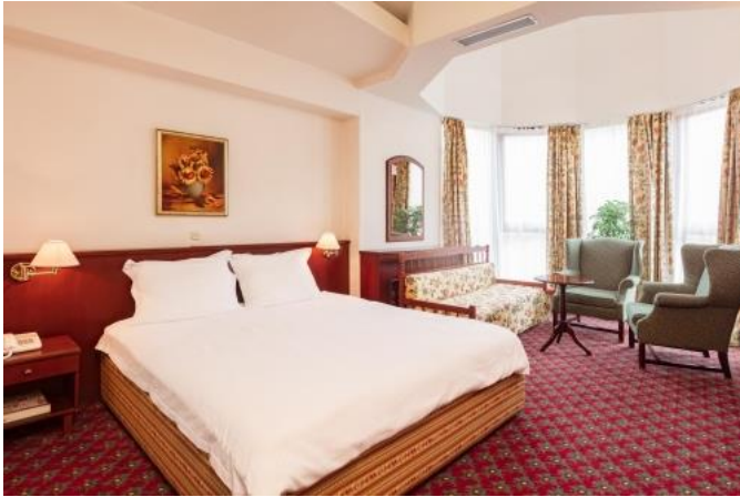
Double room at Hotel Bistra

The Hotel Bistra is a 118 room hotel close to the lake shore, near the foot of the mountain. The hotel has a pool and spa.