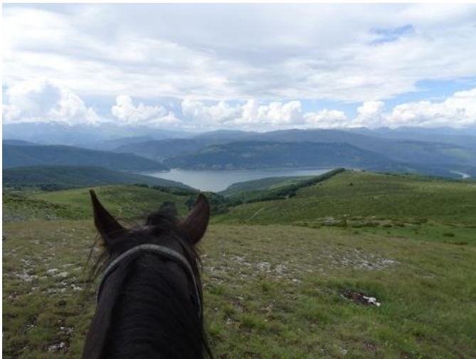
View of Mavrovo Lake

After lunch, your guides will take you to the Sandaktash Peak (2,011 m/6,597 ft) and bring you down to Mavrovo Lake and the village of Mavrovo.