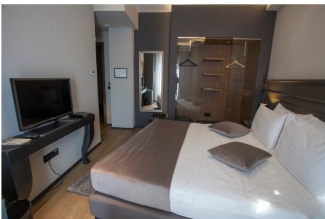
Double room at the Hotel Solun

The Solun is a modern 53 room centrally located city hotel.