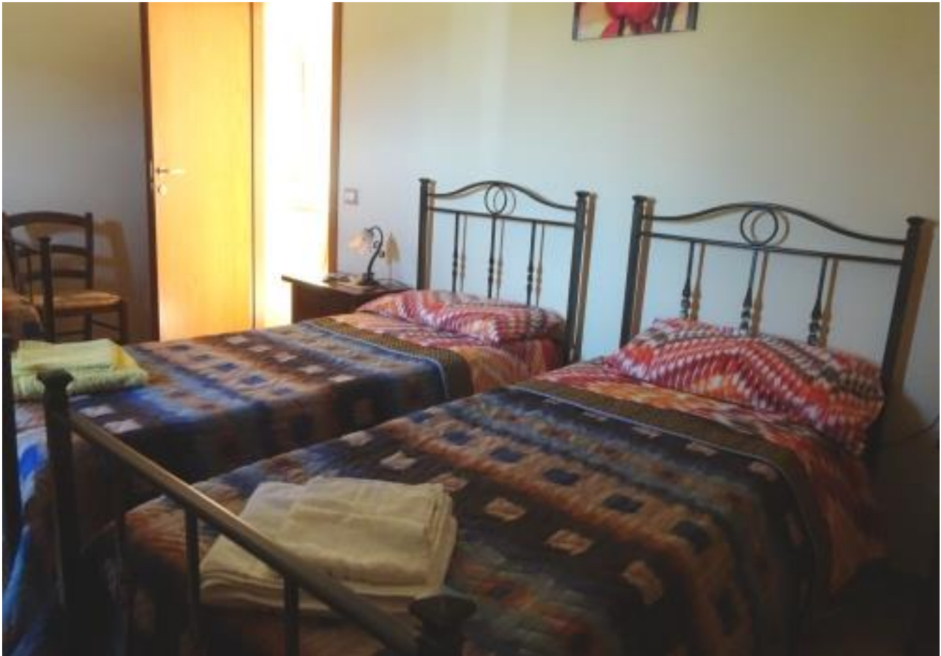
Twin Room at Casa Il Bosco

This charming, restored nineteenth century country house is surrounded by the wilderness of Madonie Park.