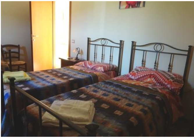
A twin room at Casa Il Bosco