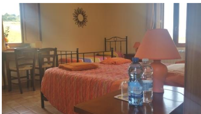
One of the bedrooms at Casalvecchio