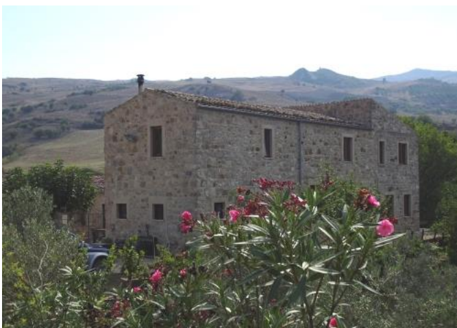
Casa Il Bosco

This charming, restored nineteenth century country house is surrounded by the wilderness of Madonie Park.