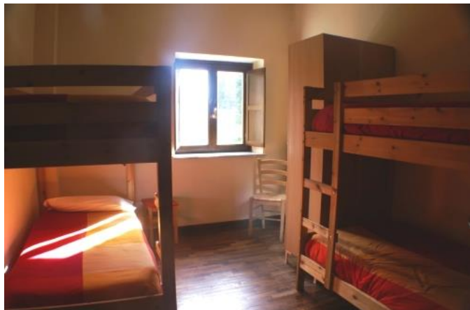
One of the bunk rooms at Rifugio Marini

Overnight Rifugio Marini. This 18 room refugio offers simple accommodation, with mainly bunk rooms and some twin rooms.