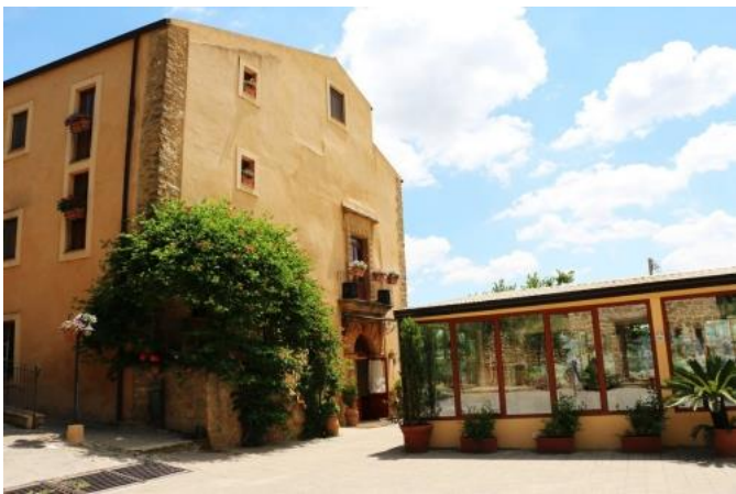
Torre di Renda

Overnight Torre di Renda. Torre di Renda is an old structure which was formerly the local bishop's residence, equipped with a swimming pool. The hotel is in the territory of the famous medieval town of Piazza Armerina.