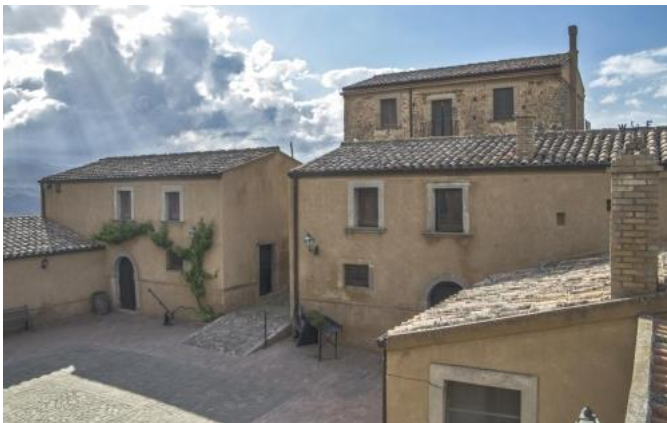
Baglio San Pietro