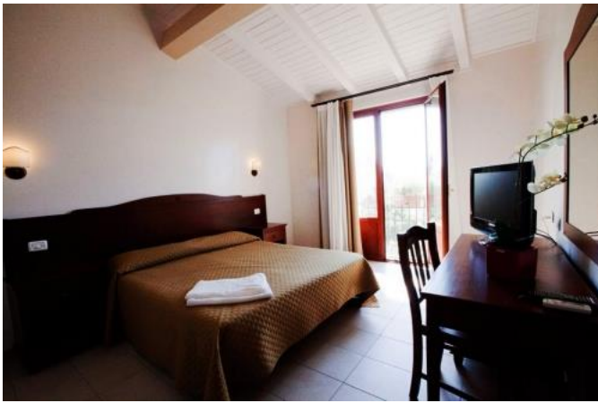
One of the bedrooms at Torre di Renda