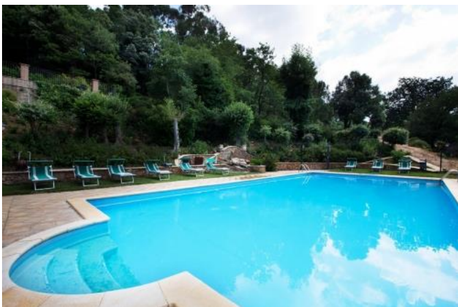
Pool at Torre di Renda