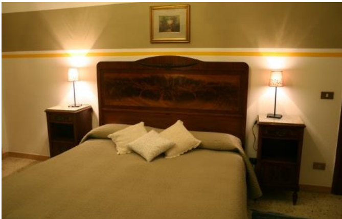
A bedroom at Il Mandorleto

Overnight Agriturismo Il Mandorleto. This hotel is situated in an old agricultural hamlet, famous for its production of almonds - one of the key ingredients in Sicily's culinary traditions.