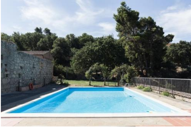
Pool at Baglio San Pietro

Overnight Baglio San Pietro. This restored farmhouse sits on the edge of the town of Nicosia, one of the most important towns in the province of Enna.