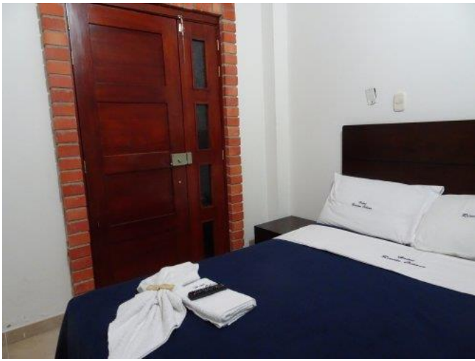
Room at Rincon Obiano