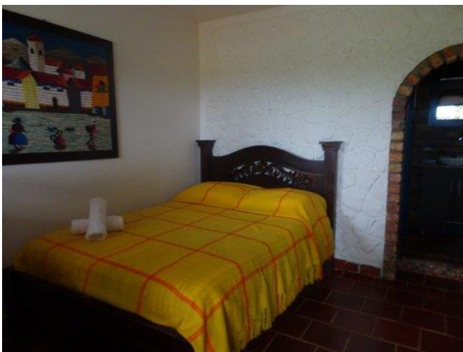
Campestre Capilla Del Pienta

Overnight Campestre Capilla Del Pienta. A small country hotel on the outskirts of Charalá. The natural water pool overlooks the river.