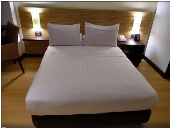
Double room at Scala 68