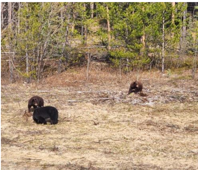
Family of grizzly bears

Ride along Pilot Mountain and view Dall sheep, possible grizzly and moose.