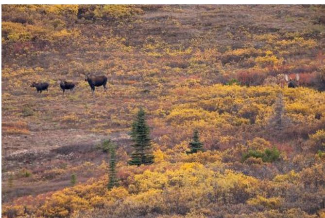
Family of moose on the mountain side.

Search for the ruins of old trapper and hunting camps that have been used many years before us. Look for moose or sheep up close.