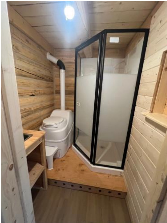
Bathroom in the Northern Lights cabin.

The smaller Klondike is the original cabin and has an outdoor toilet.