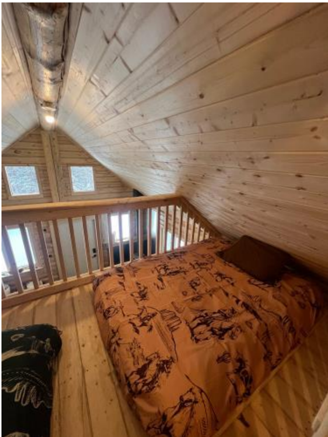
Sleeping platform in the Northern Lights Cabin

The main Northern Lights cabin is larger and has its own bathroom.