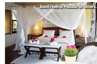
Guest room at Pousada do Outeiro.

Waking up early on my first morning in Bahia, I gazed out of the window as the sun came up. Just beyond my deck was a small path that snaked down to an incredible beach. A little tired from my overnight flight, I decided that an early morning swim in the hotel pool would blow the cobwebs away. Then it was off to the central dining area for a breakfast feast of fresh mangoes, ripe bananas and bright orange papayas. There was yoghurt, muesli, cheese, ham, cakes, quiches and scrambled eggs and I got my first taste of tapioca – in Bahia they fry the tapioca into a sort of pancake and stuff it with cheese, or banana or coconut. It was utterly delicious and the perfect feast to set me up for the day.