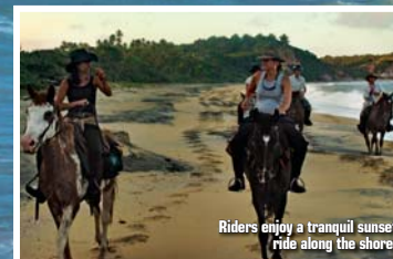
Riders enjoy a tranquil sunset ride along the shore.