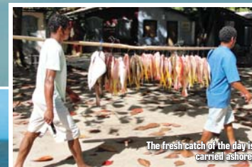
The fresh catch of the day is carried ashore.

THE BEACHES WERE TRULY EXCEPTIONAL AND FELT AS THOUGH THEY WERE MADE JUST FOR LOVELY LONG CANTERS.