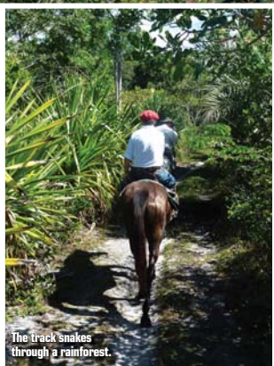
The track snakes through a rainforest.

and proud-looking Peba to name but a few. After a safety briefing and assessment ride around the spectacular polo field we set off on our first ride. We cantered through cattle pasture, winding our way along narrow rainforest paths and passed through a small town. From the little bars and restaurants that line the dusty streets we heard a cheerful chorus of 'oi' and on returning the greeting, we were rewarded with enthusiastic waves and huge face-splitting smiles. The welcome in Bahia was overwhelming and I felt very lucky.