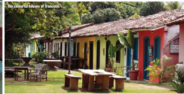
The colourful houses of Trancoso.