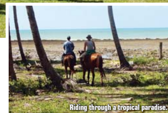
Riding through a tropical paradise.

While the main base is the luxurious Pousada do Outeiro, the Bahia beach ride takes you on a journey, giving you the chance to stay at beautiful guesthouses in Trancoso and Caraiva along the way. Pousada do Outeiro is on the cliffs above Espelho Beach and is the perfect place to relax, unwind and take in the beautiful setting. With hammocks to swing in, a large pool to cool off in and the Outeiro Clubhouse to explore it makes the perfect base.