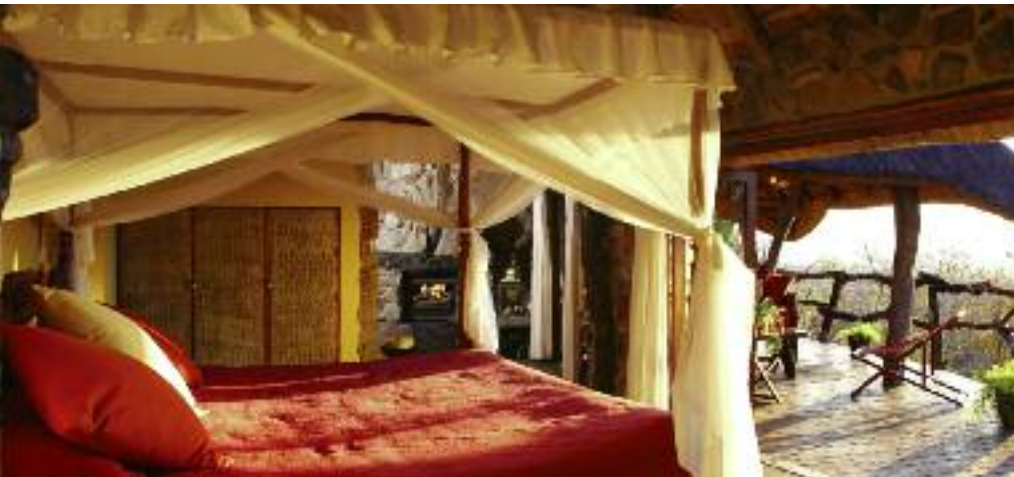
Honeymoon suite at Ant's Hill, South Africa, p 115